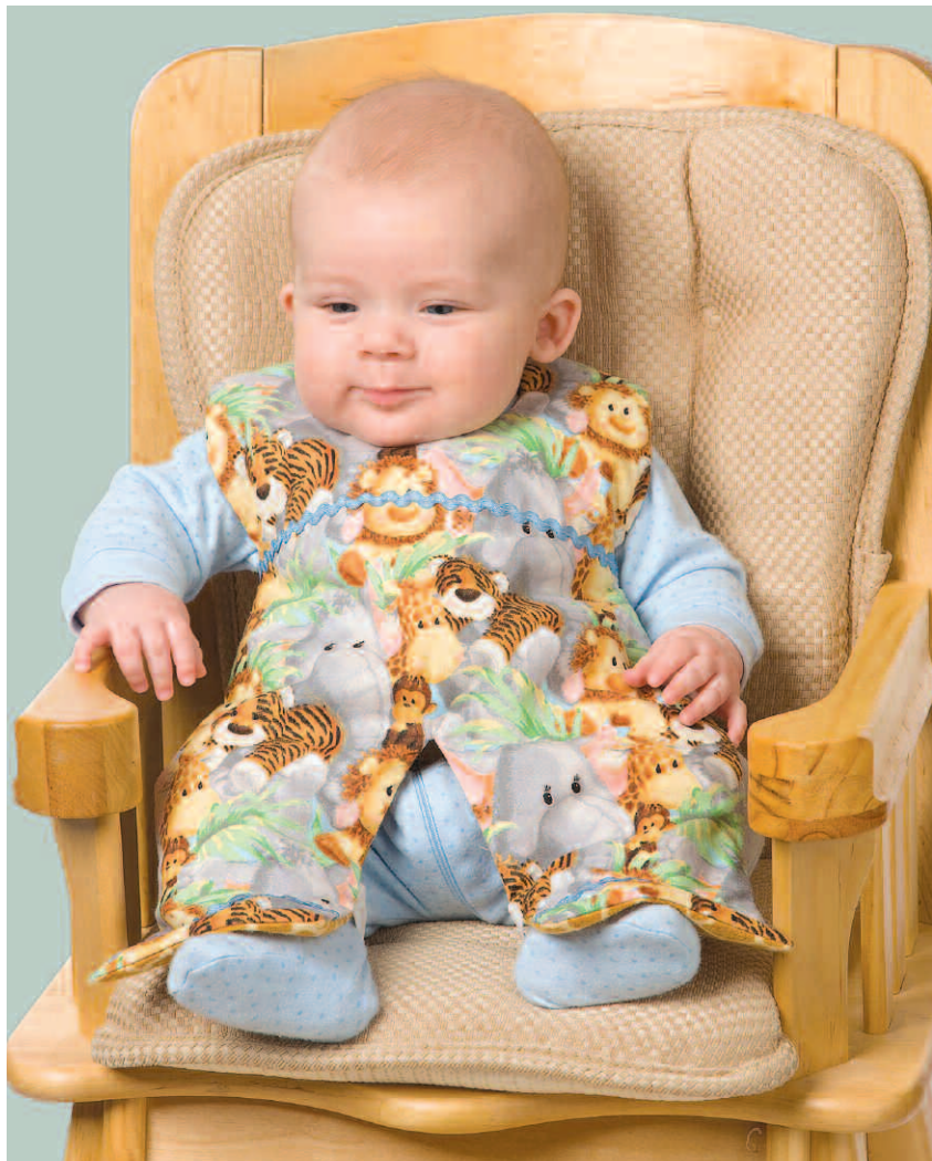
gotcha-covered baby bib