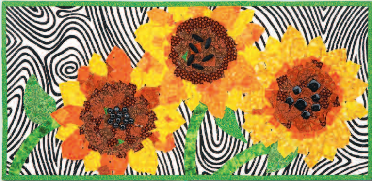
sunflower mini quilt