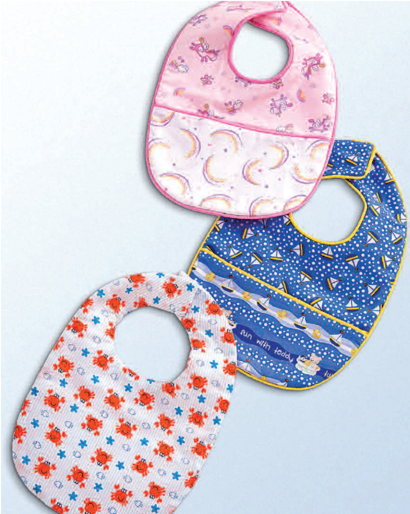
baby bib with pocket

Crafts. Discover life's little pleasures.