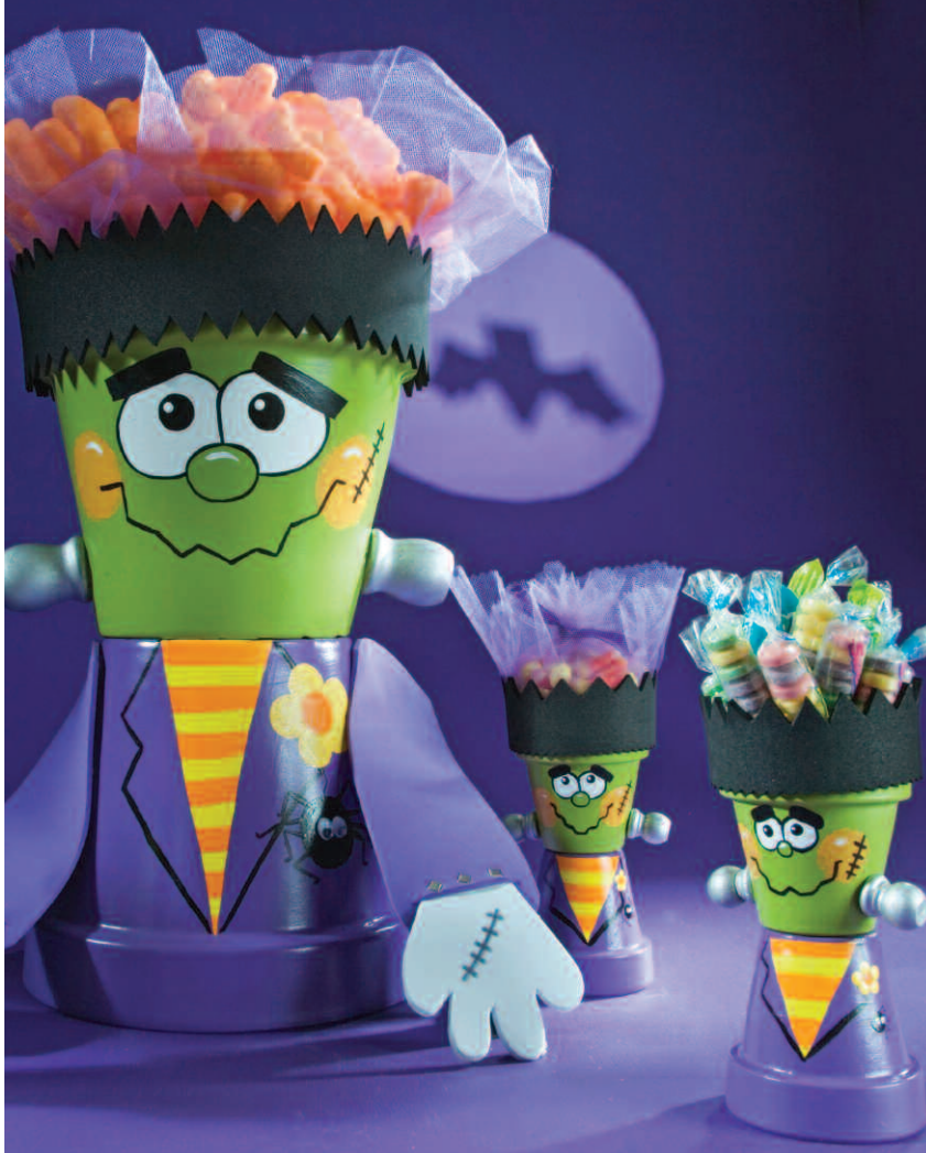
trick-or-treat monster pots