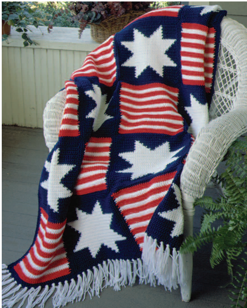
stars & stripes afghan