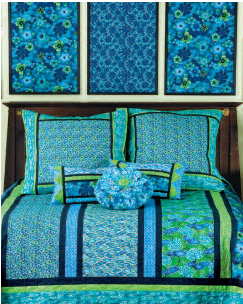
journey east pillows