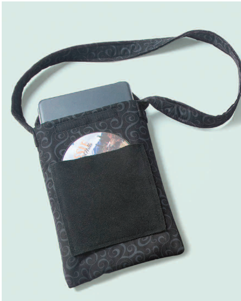
portable DVD player case