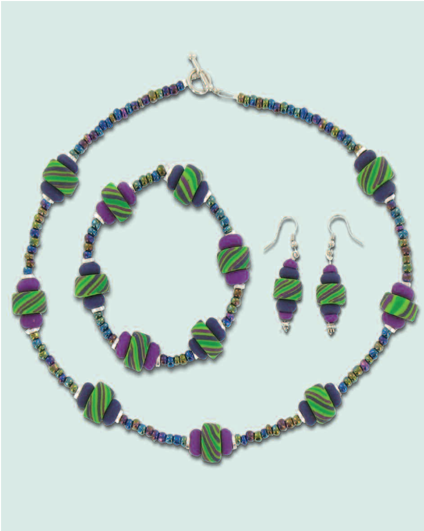
spinner bead jewelry

Crafts. Discover life's little pleasures.