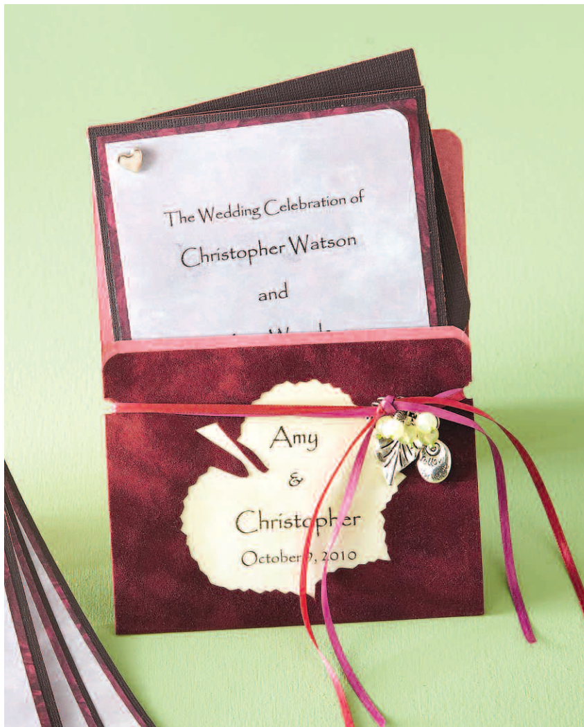
personalized wedding program