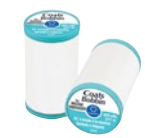
S978 Thread Wt. 70