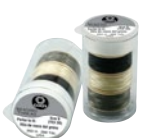
D80 Thread Wt. 35