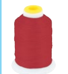
D71 Thread Wt. 12