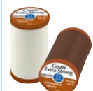
S964 Thread Wt. 15