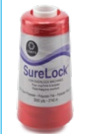
6110 Thread Wt. 40