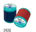
S920 Thread Wt. 10