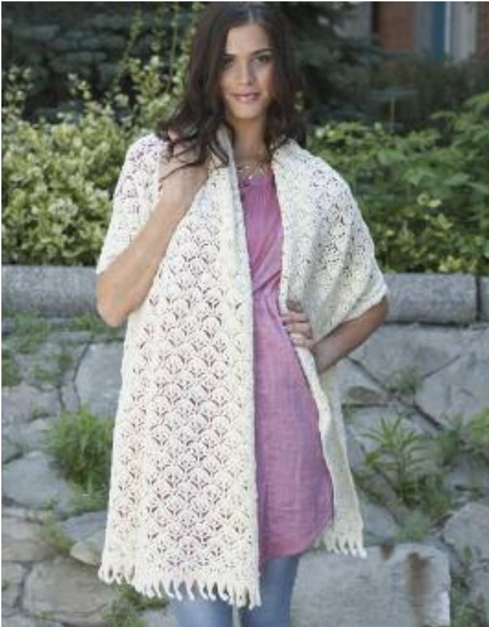
PATONS® KROY SOCKS CROCHET SHAWL