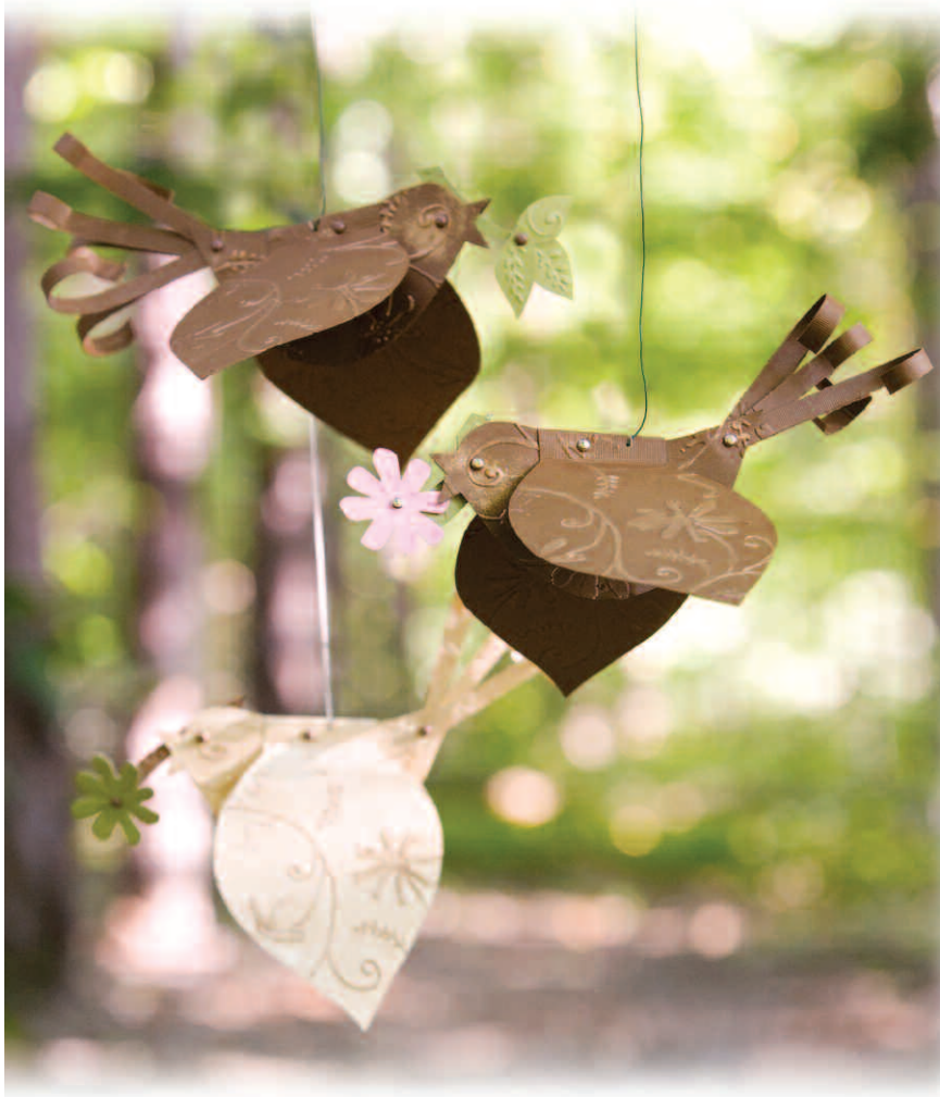
embossed paper birds