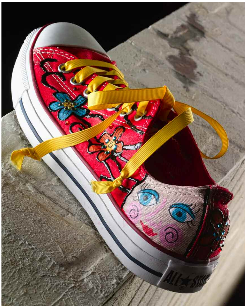
handpainted tennis shoes