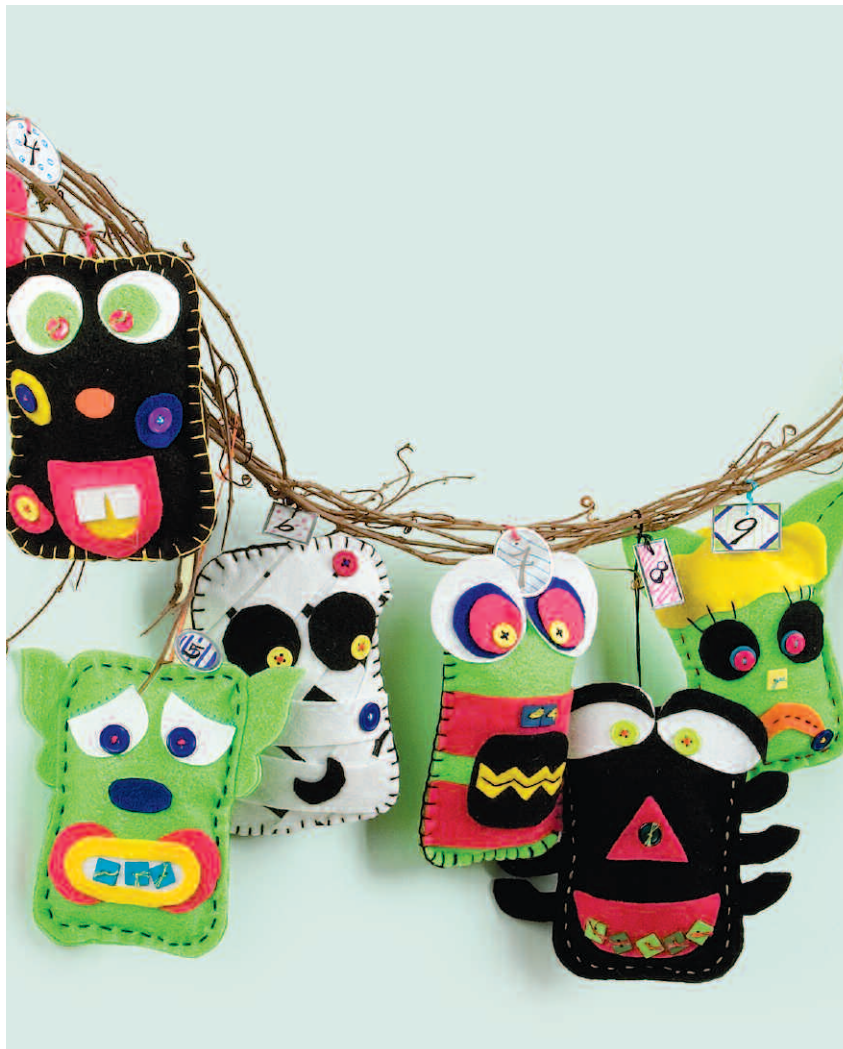
monster countdown calendar