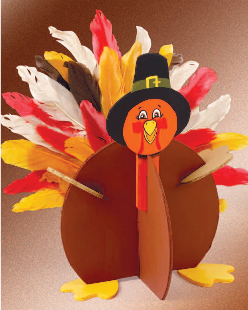
thanksgiving turkey centerpiece