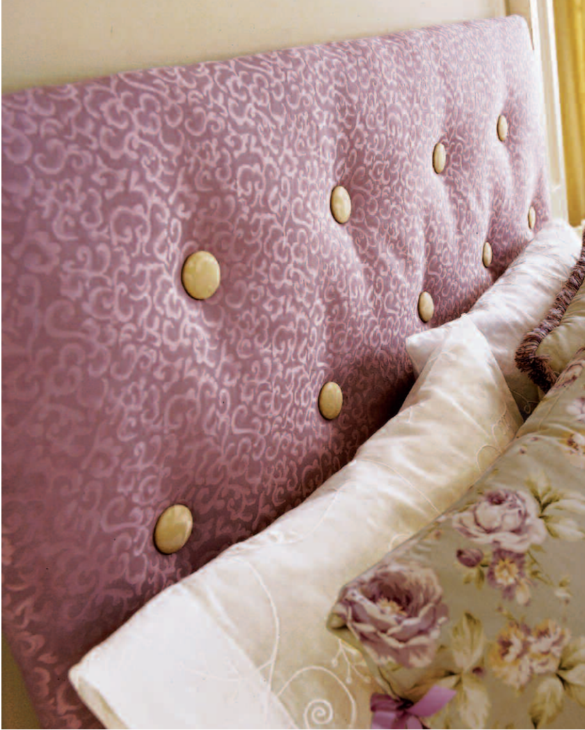
upholstery covered headboard