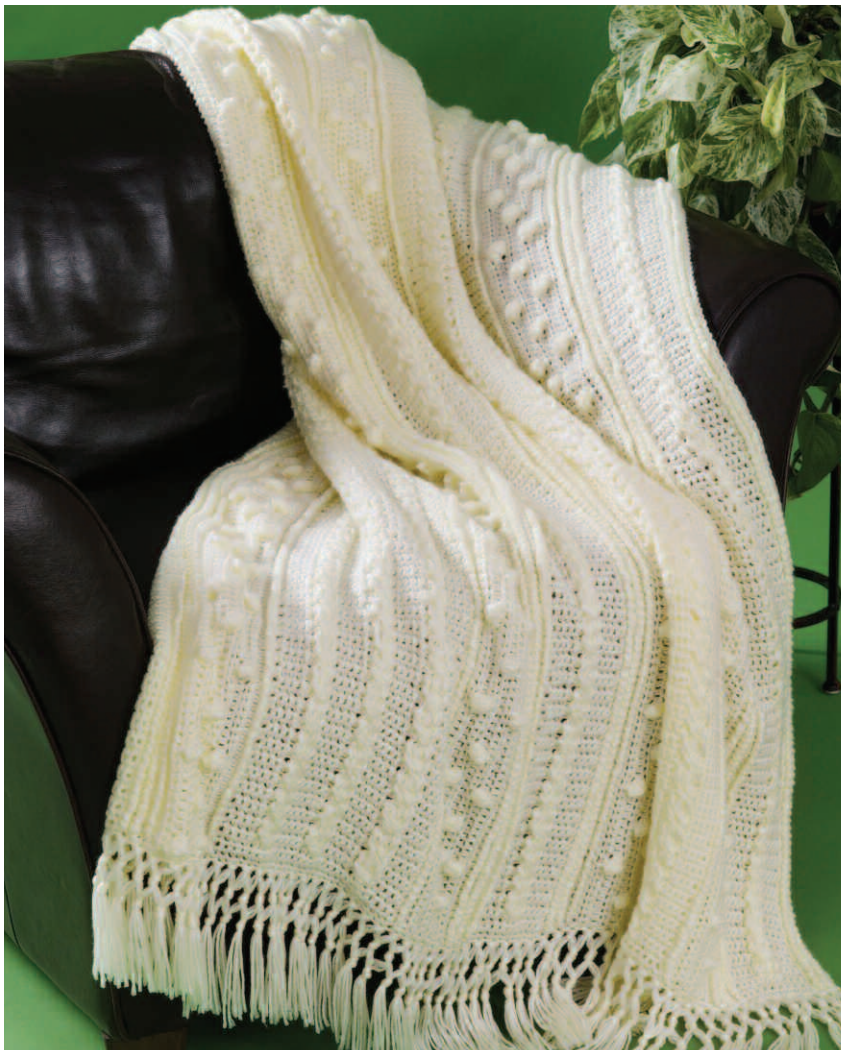
crochet aran afghan